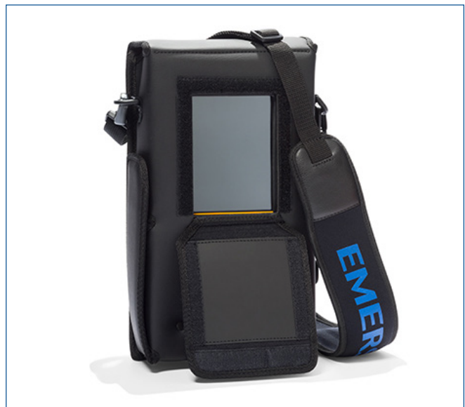
The useful carrying case protects your Trex unit in the field and provides storage options for accessory items.

Using the ValveLink Mobile app on the Trex unit, you can perform valve diagnostics in the field, including valve signature, dynamic error band, PD one button sweep, and step response, without having to pull the valve or perform invasive troubleshooting steps. ValveLink Mobile works with HART and FOUNDATION Fieldbus Fisher® FIELDVUE™ digital valve controllers and provides an intuitive user interface that is easy to understand and use. The large touchscreen on the Trex communicator makes it easier than ever to see all valve diagnostic details.