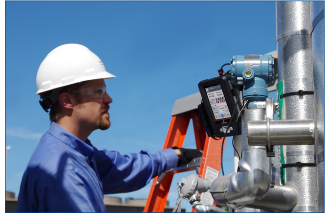
The magnetic hanger accessory allows you to attach the Trex unit to a pipe, freeing up your hands for other work.

You can also verify whether the DC voltage is correct in HART loops.